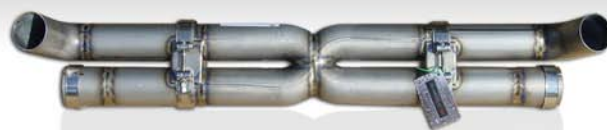
QuickSilver 2.8 kg (6.17294 lbs)

Superior Exhausts for the World's Finest Cars