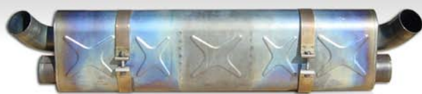
Original System 5 kg (11.0231 lbs)