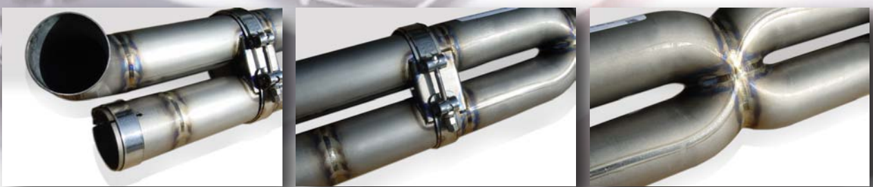
The Titanium welds achieved on this QuickSilver System are exceptionally smooth and clean.